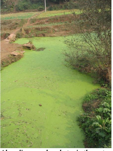
Algae lives on phosphates in the water (from detergents) and consumes the dissolved oxygen in the water.

result, can reduce the number and diversity of aquatic life forms over time (e.g. trout). Phosphate, a chemical compound in detergents, serves as "food" for algae. As a result, industry was forced to remove it from detergents.