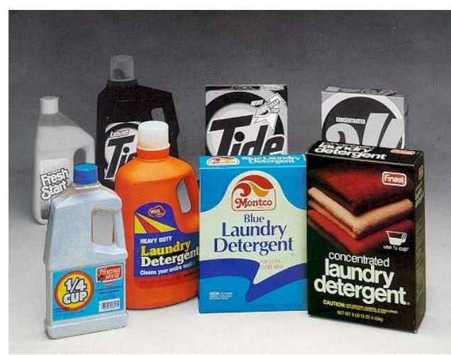
A selection of available laundry detergents.

Cleanliness is a very important aspect of living in today's world. Many people have become infatuated with cleanliness as a result of the various advertisements and television commercials that have been produced and broadcasted. Simply consider how many people change their clothes and shower several times each day. Such actions require the use of soaps and detergents, which explains why the manufacturing of such cleaning fluids has become a multi-billion dollar industry. Many people even have strict preferences in relation to soaps and detergents, which explains why there is such a large and complex selection made available to people in retail stores.