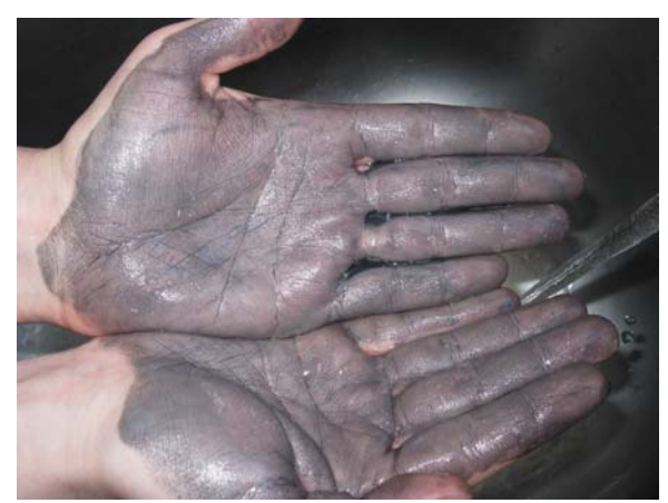
Cleaning snowmobile grease from your hands using water is highly problematic.

People rarely experience problems with cleaning substances such as mud and clay from their clothes and bodies since both are soluble in water and therefore, can be cleaned off. To the contrary, people often experience problems with cleaning substances such as oil and grease from their clothes and bodies since both are insoluble in water and therefore, cannot be cleaned off easily. A soap or detergent would be required to make cleaning off such substances easier.